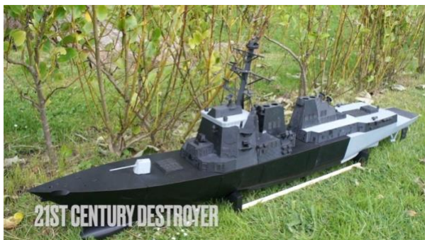
21ST CENTURY DESTROYER