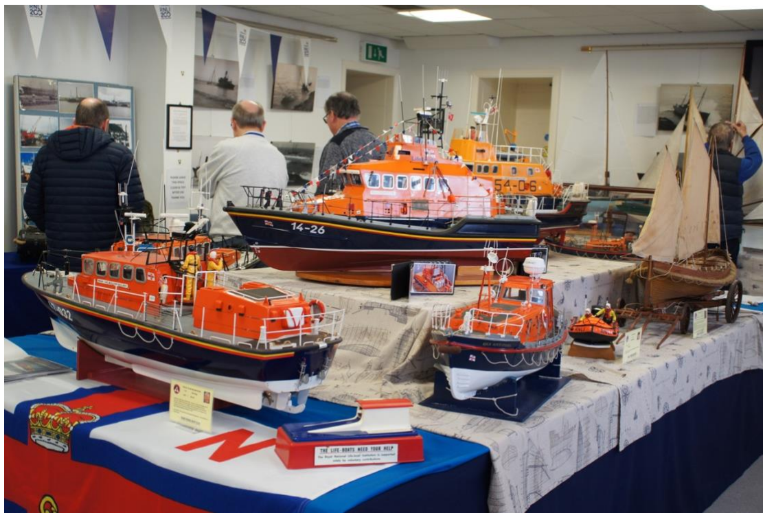
The grand Lifeboat display stand.

Show day, and no rush to open up, 8:30. Erected the banner on the Palm trees outside and with the last boats arrived we were ready to greet the first visitors from 10.