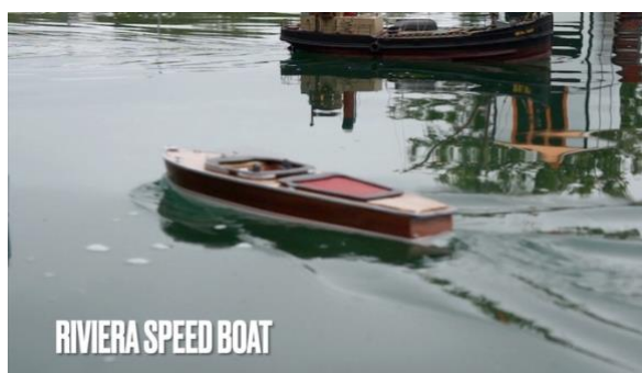
RIVIERA SPEED BOAT