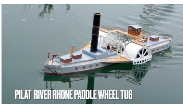
PILAT RIVER RHONE PADDLE WHEEL TUG