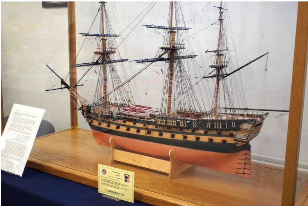
Geoff Gell's HMS Agamemnon at 1/64 scale

Take down is always a marvel at any show. It is quite amazing how quickly an entire room full of models on tables suddenly becomes an empty space. I think it took about an hour for every thing to be cleared.