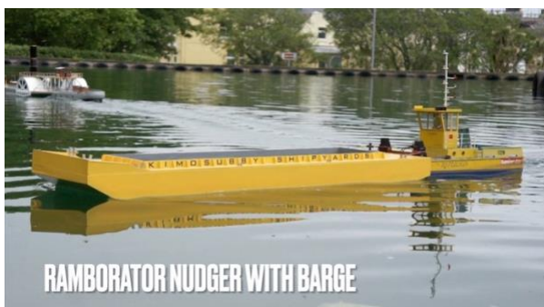
RAMBORATOR NUDGER WITH BARGE