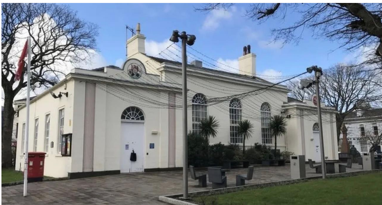
The old Courthouse, Ramsey