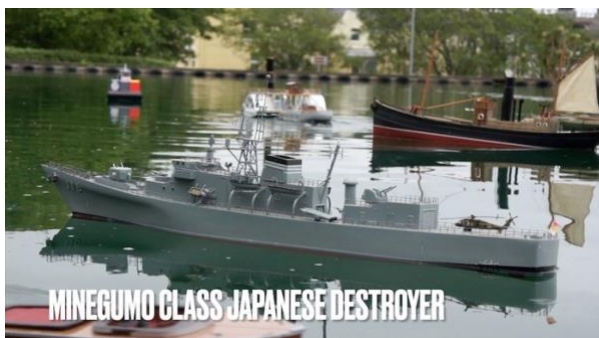
MINEGUMO CLASS JAPANESE DESTROYER