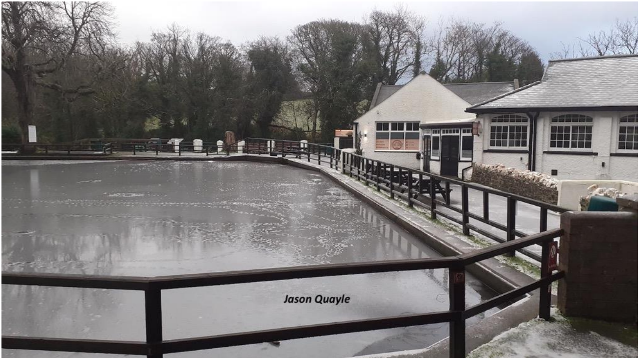
December 3 rd 2023 a typical Sunday sailing day!