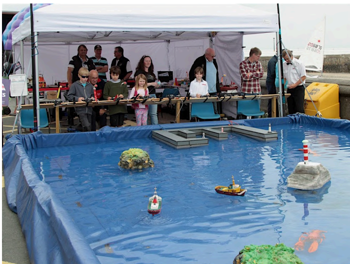
Ramsey Life Boat Day

On behalf of the Ramsey Station may I sincerely thank all those that helped out, we do so much appreciate your time and efforts. This stand is much anticipated by the "youngsters."