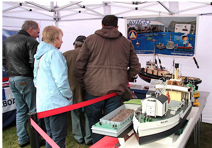
Ramsey Life Boat Day

The one good thing not having the Av-a-Go pool, meant we were able to take down and pack away quickly and were on the road home by 6pm.