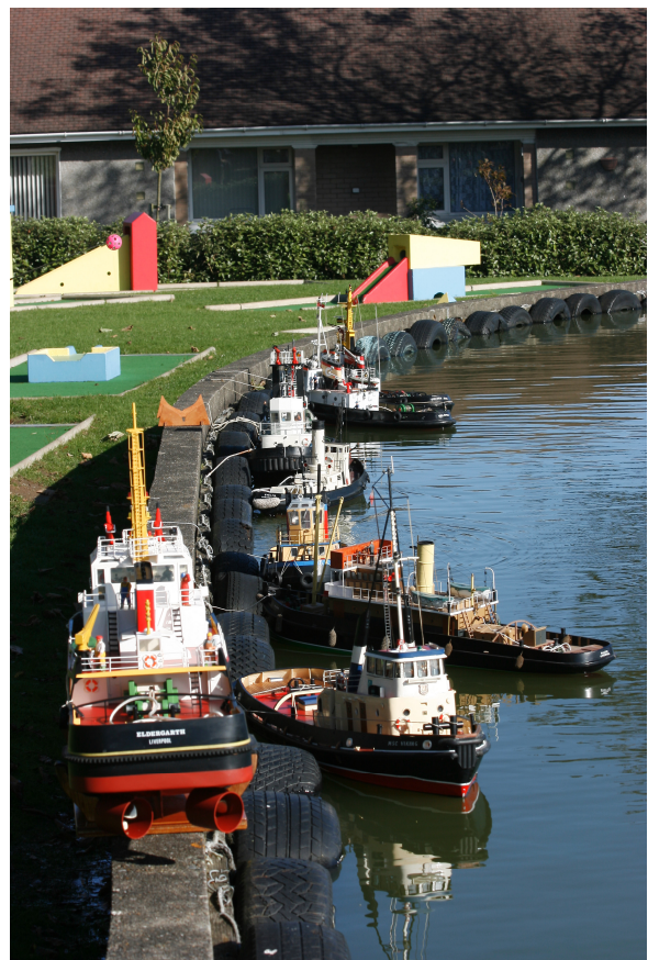
An impressive line up of “Tugs” at the tug towing competition.