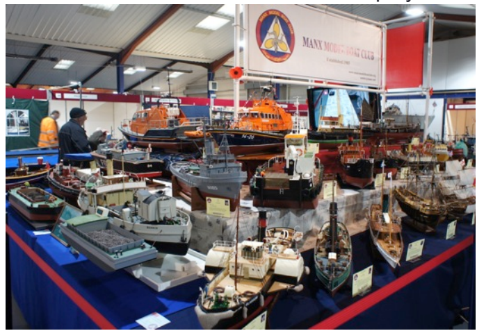
Left hand side