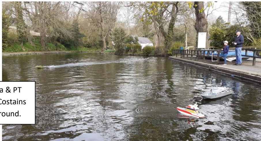
In addition to the Pakasa & PT boat you can see Dave Costains new model in the foreground.