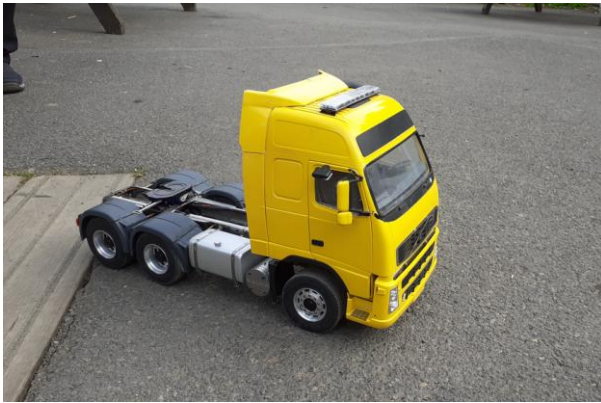
This truck was built & driven by Bill Callow.