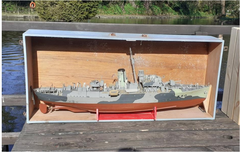
Scott Booths HMS Bluebell at Silverdale complete with transport box.