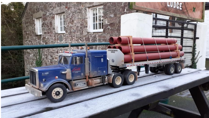
Scott Booths 'Ice Road Truckers' Big Rig, complete with realistic ice road conditions on a chilly Sunday morning in January.