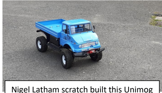
Nigel Latham scratch built this Unimog based on a Land Rover chassis.