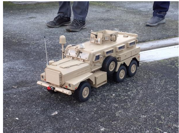
One of Brian Swindens impressive military trucks.