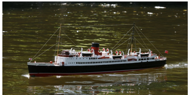
Photograph of Monas Queen taken during Mannanan 2008