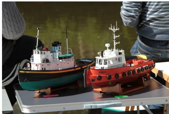
Two of Brian Swinden's boats