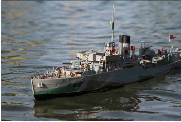
One of the winning Flower Class Corvettes