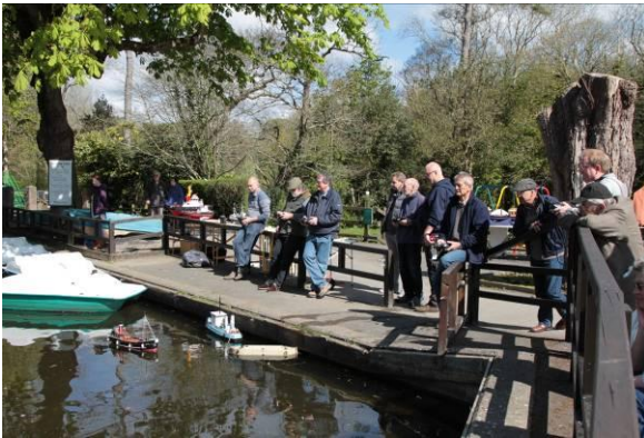
Spectators watching the Scale Competition