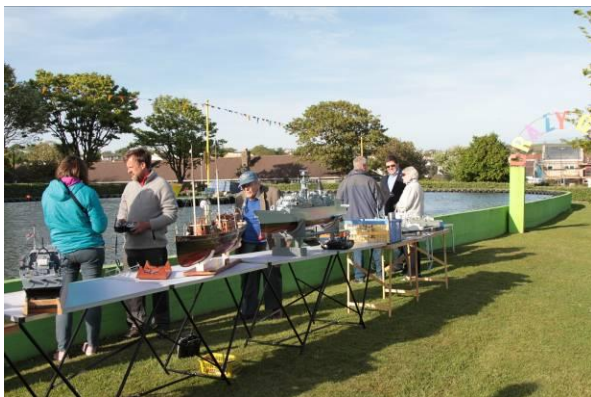
Competitors at the Spithead Review