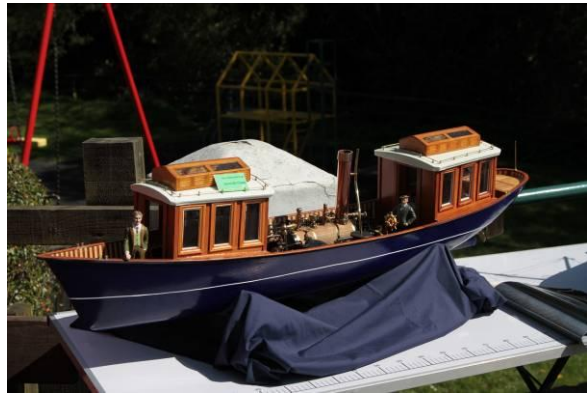
John Williams Steam launch