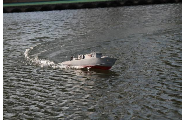
Brian Kings range safety launch