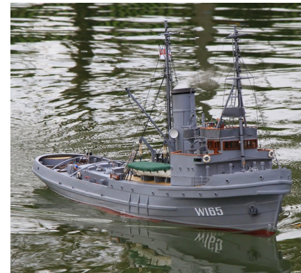
Jason Quayle's Envoy often referred to as W165 in results, winner kit class.

The On-the-Water had ten entrants, and quite a few different boats from the static list. We employed a "busier" approach to this event and had all entrants on the water ready to go, calling them forward to the harbour side as soon as a boat had completed a lap. Each boat did two laps of a simple course, and in this way each encountered other vessels and happenings along the way. The judge was then able to add a dis-