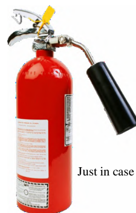
Just in case