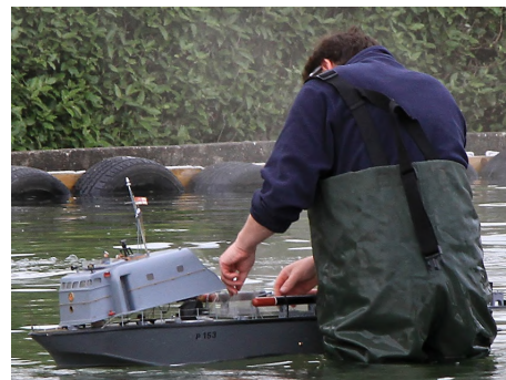
"SPITHEAD on fire"