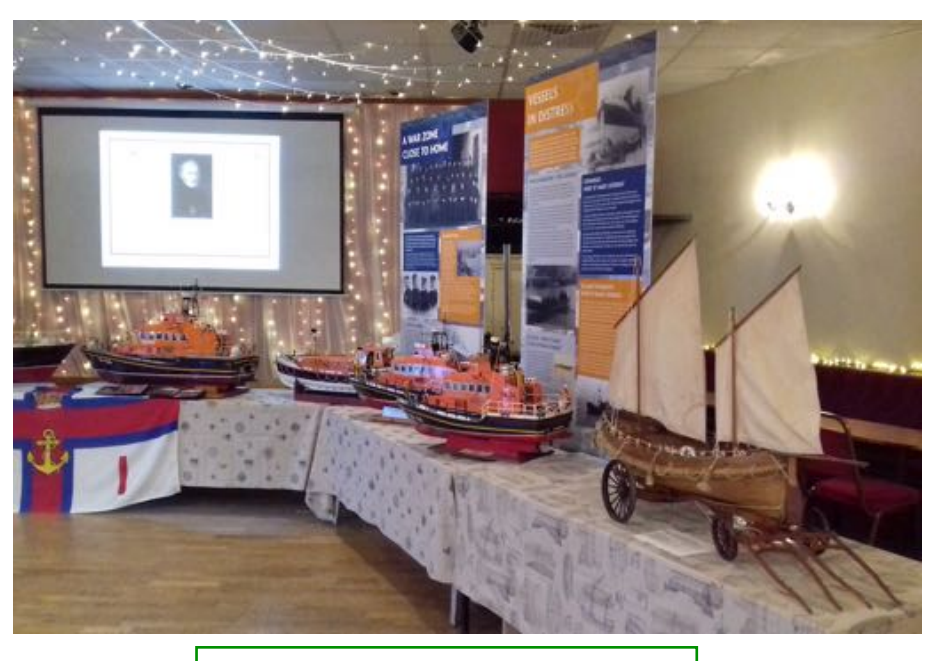
The display for the William Hilary service