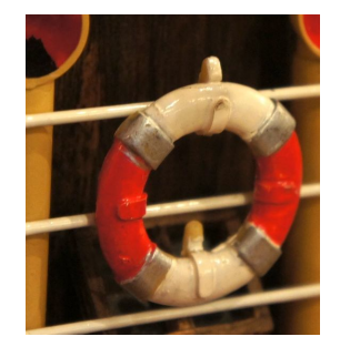
Can you identify which model boat these lifebelts are attached to? No prizes, just a bit of fun this time around. Ed.