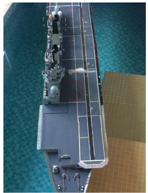
A couple of photographs from Mike showing HMS Illustrious during ballasting tests.