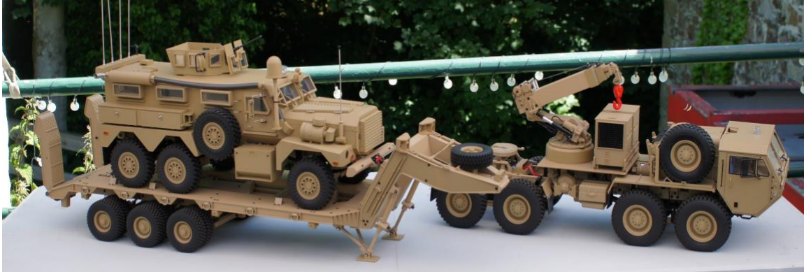
HEMTT military truck and trailer with MRAP – Brian Swinden

Whilst the vehicles were being judged, some members were thrilling the crowds and themselves using the small display pool for the memorial runs of Bob's Challenges, pop-pop boats and furious assemblages of milk cartons etc whooshing around the little pool.