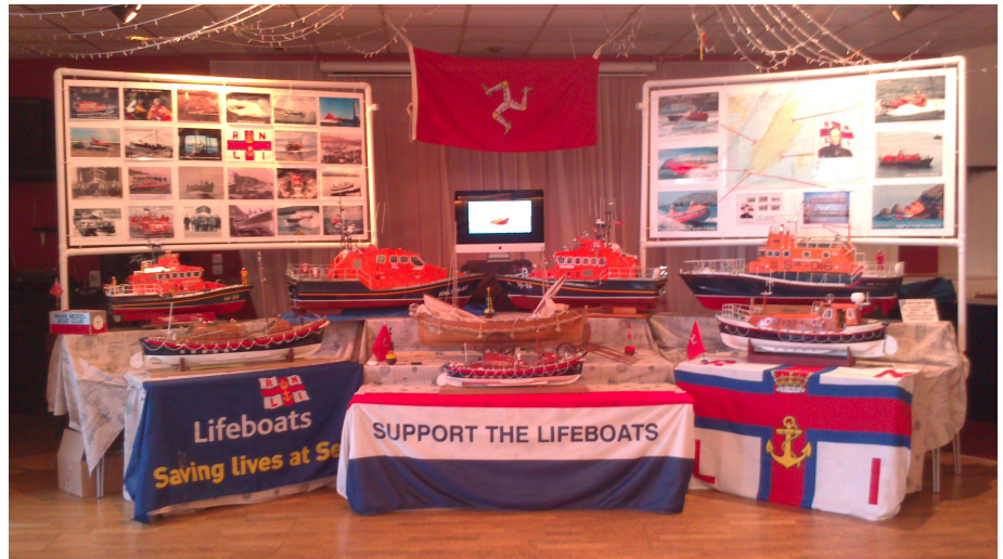
The display Les Quayle photography

The second event of the year was the display given on the Sunday afternoon following the Sir William Hilary memorial service January 10 th . The display was actually the section of the display used at the Warwick 2015 Show and included other Club lifeboats as well. It was a really well turned out showing and received many