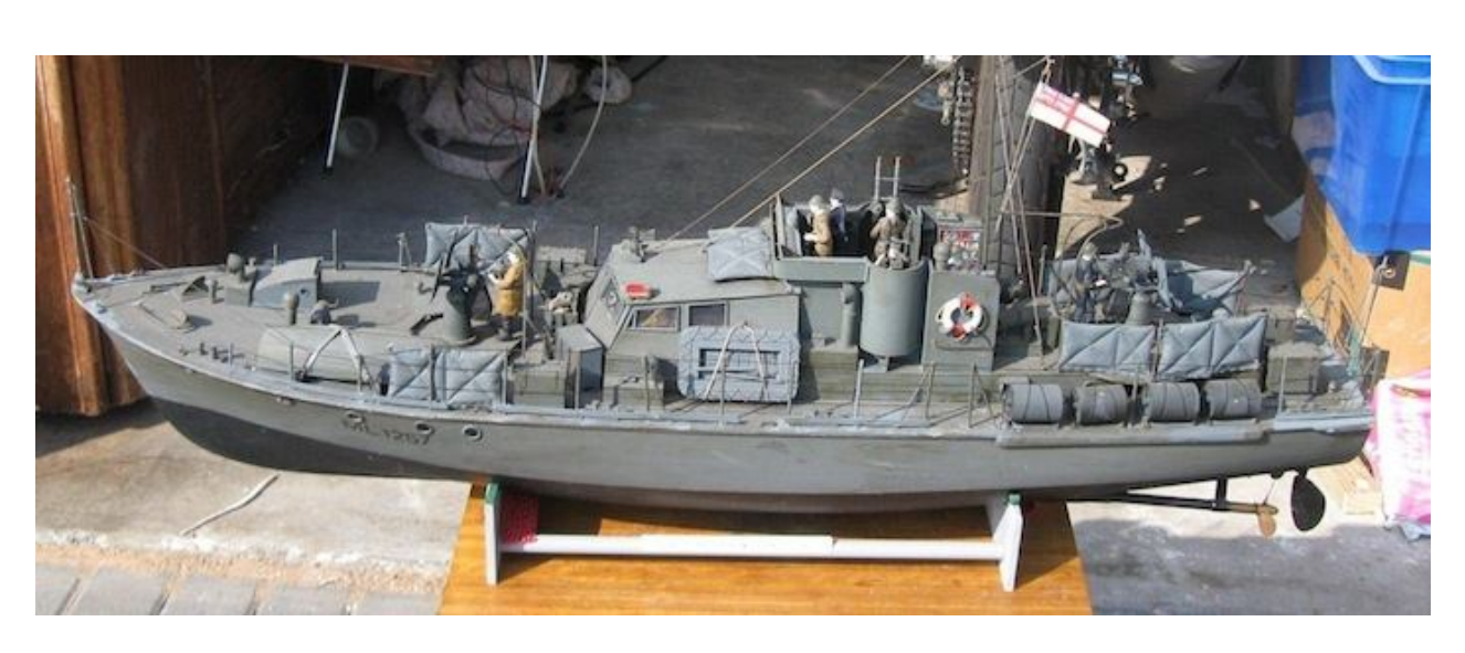
Harbour Defence Motor Launch

THEN I GOT MAD AND THREW THE ARTICLE AWAY